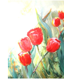
Red Tulips by Lynne Weeks