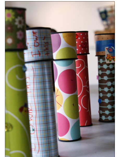
Kaleidoscopes by children from Monet In the Making